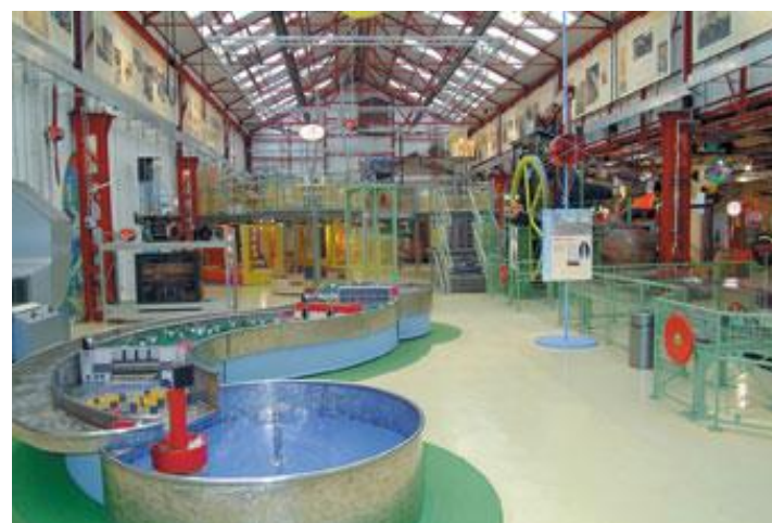
Enginuity D&T Centre

We can schedule around your programme, or en-route to Condover.