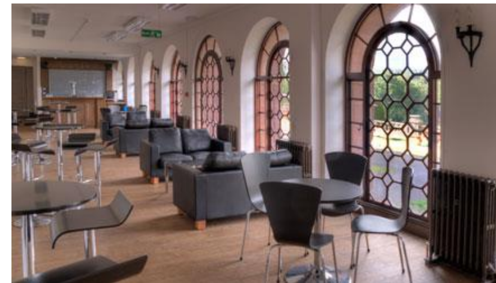
'The Orangery', adult bar