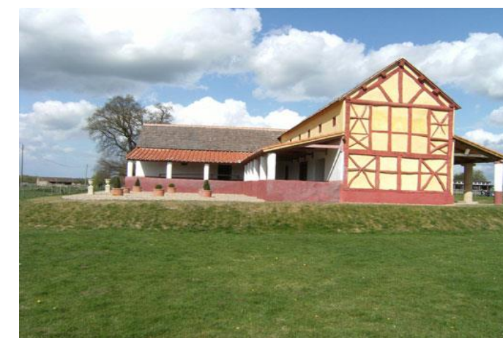
Wroxeter Roman City