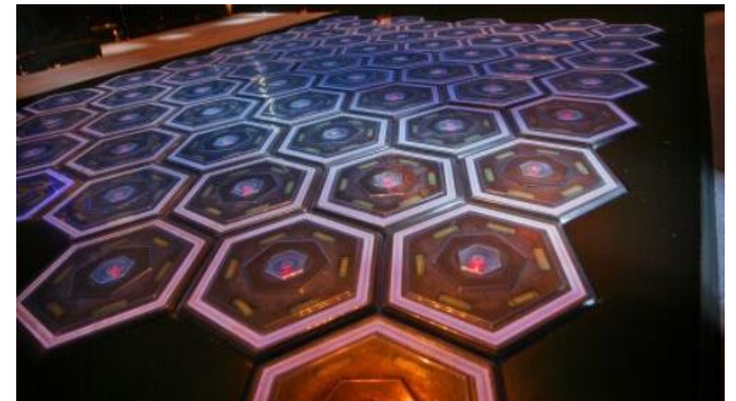
Grid of stones