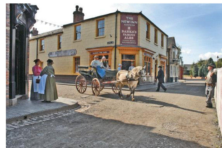
Blists Hill Victorian Town