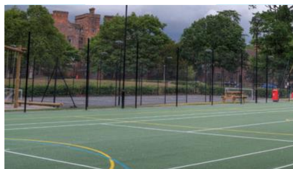
All weather sports pitches