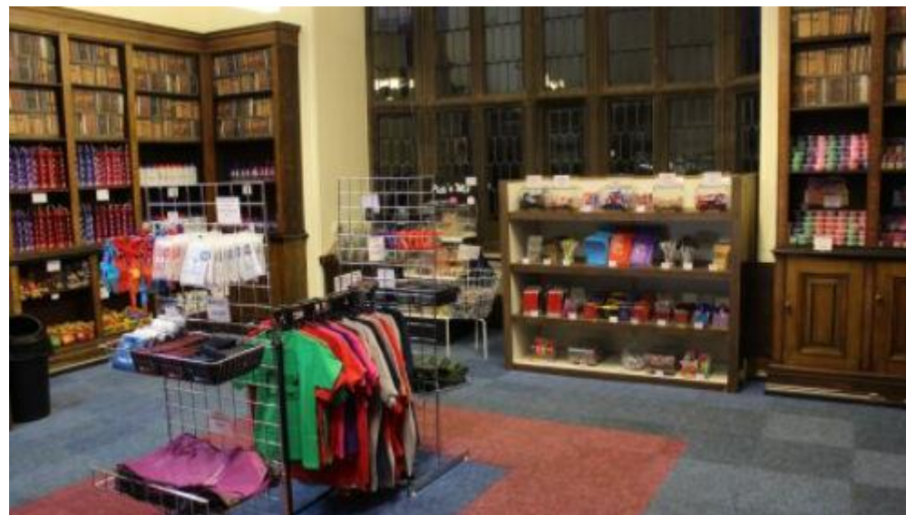
Tuck shop/Gift shop