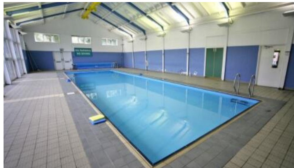
Indoor swimming pool